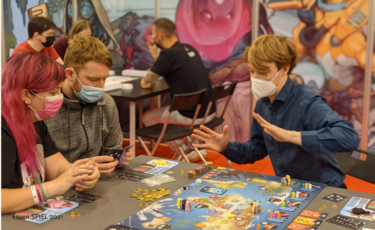
Essen SPIEL 2021