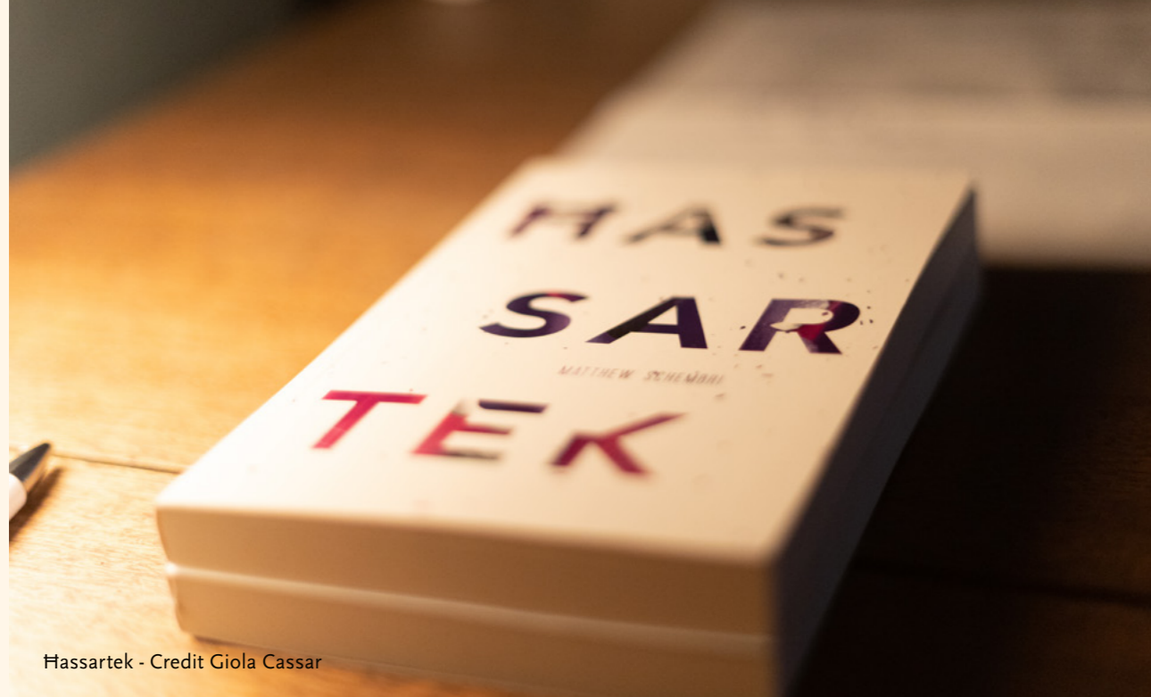
Hassartek