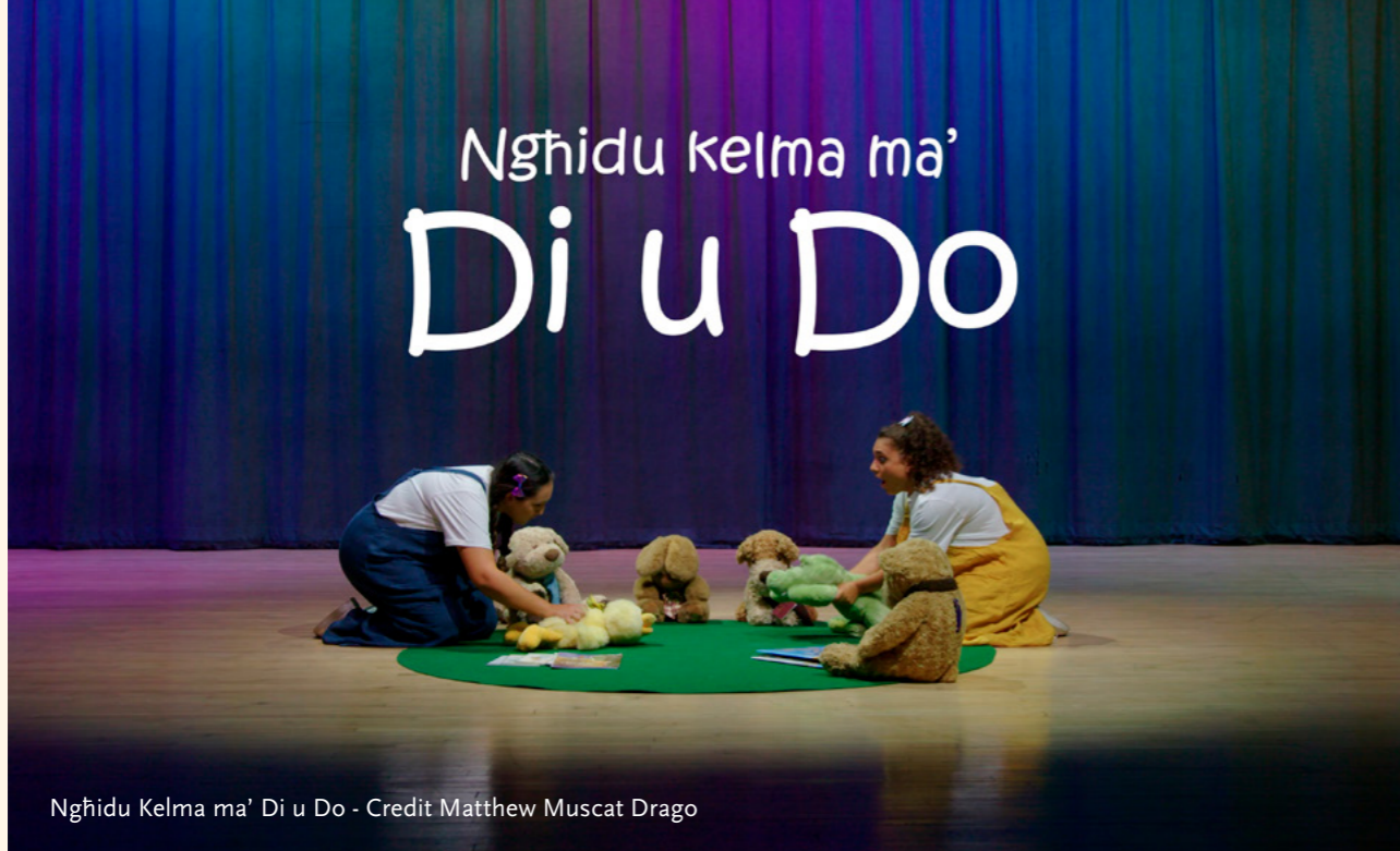
Nghidu Kelma ma' Di u Do