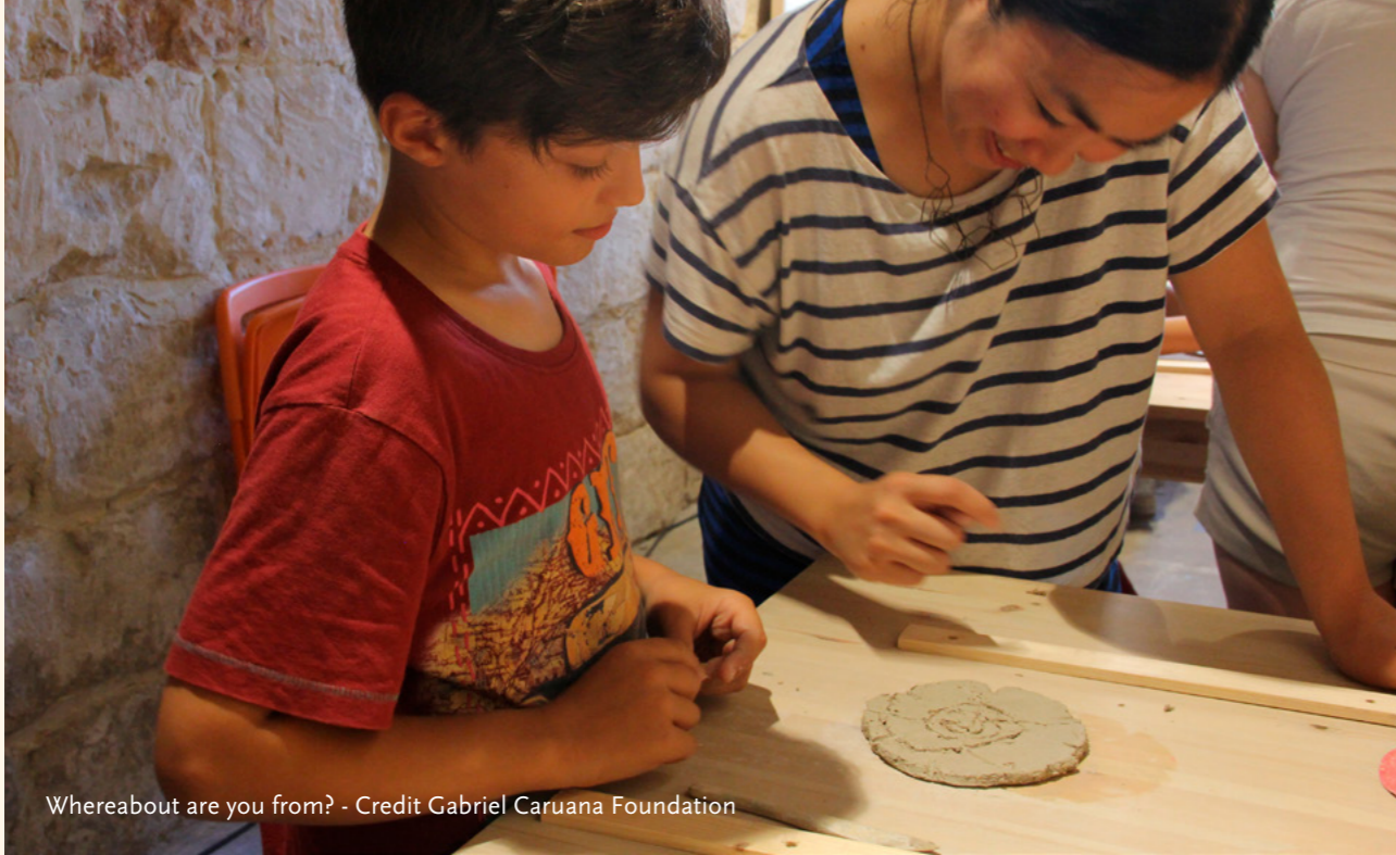
Whereabout are you from?